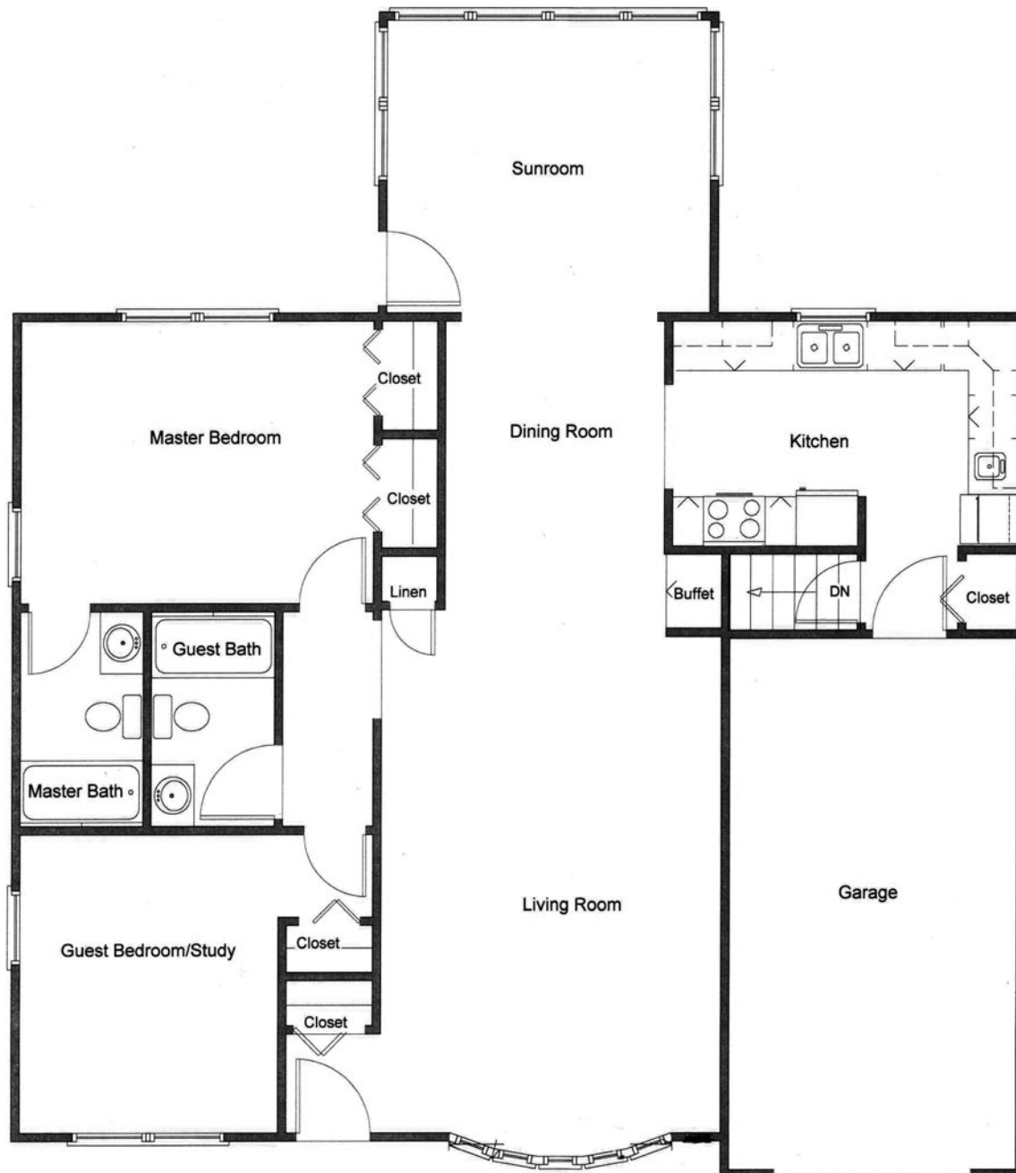
Oak Crest DeKalb Area Retirement Center Roberts Lane & Centennial Drive Duplex Floor Plan - 1300 Sq ft. Not to Scale

Come visit one of our featured 1300' duplex homes and see what all the excitement is about. Oak Crest is located at 2944 Greenwood Acres Drive, DeKalb. Individuals interested in hearing more about this next chapter in Oak Crest history should contact Liz Hoppenworth at (815) 756-8461 or email her at lhoppenworth@oakcrestdekalb.org